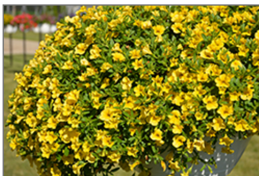
Cabaret Deep Yellow Calibrachoa in bloom