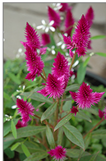
Intenz Classic Celosia flowers

Intenz Classic Celosia is recommended for the following landscape applications;