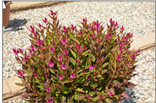
Intenz Classic Celosia in bloom

Intenz Classic Celosia will grow to be about 14 inches tall at maturity, with a spread of 12 inches. When grown in masses or used as a bedding plant, individual plants should be spaced approximately 10 inches apart. Its foliage tends to remain dense right to the ground, not requiring facer plants in front. This fast-growing annual will normally live for one full growing season, needing replacement the following year.