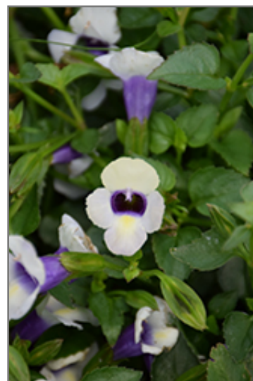
Catalina Grape-O-Licious Torenia flowers

Catalina Grape-O-Licious Torenia is recommended for the following landscape applications;