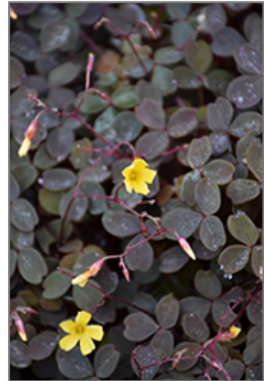
Zinfandel Shamrock flowers

Zinfandel Shamrock is a fine choice for the garden, but it is also a good selection for planting in outdoor containers and hanging baskets. It is often used as a 'filler' in the 'spiller-thriller-filler' container combination, providing a mass of flowers and foliage against which the thriller plants stand out. Note that when growing plants in outdoor containers and baskets, they may require more frequent waterings than they would in the yard or garden.