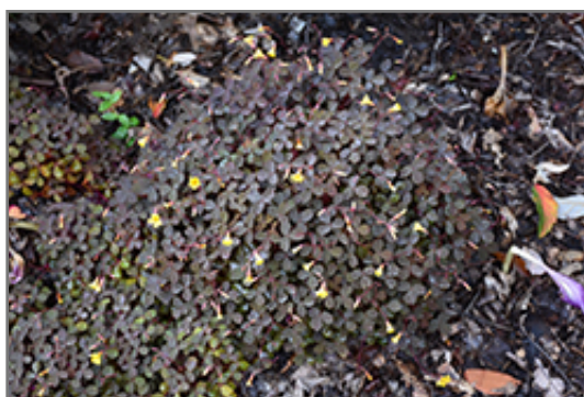
Zinfandel Shamrock