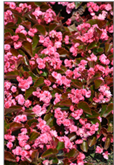
Doublet Rose Begonia flowers