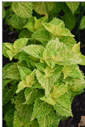
Electric Lime Coleus foliage