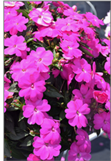
SunPatiens Compact Lilac New Guinea Impatiens flowers

SunPatiens Compact Lilac New Guinea Impatiens is recommended for the following landscape applications;