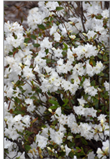
April Snow Rhododendron flowers

This plant is not reliably hardy in our region, and certain restrictions may apply; contact the store for more information.