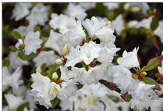
April Snow Rhododendron flowers