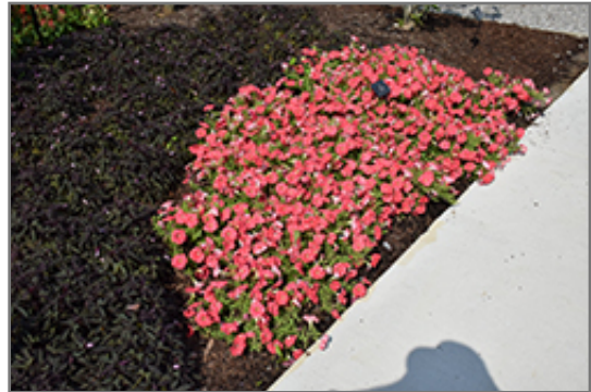
Supertunia Bermuda Beach Petunia in bloom

Supertunia Bermuda Beach Petunia is a fine choice for the garden, but it is also a good selection for planting in outdoor containers and hanging baskets. Because of its trailing habit of growth, it is ideally suited for use as a 'spiller' in the 'spiller-thriller-filler' container combination; plant it near the edges where it can spill gracefully over the pot. Note that when growing plants in outdoor containers and baskets, they may require more frequent waterings than they would in the yard or garden.