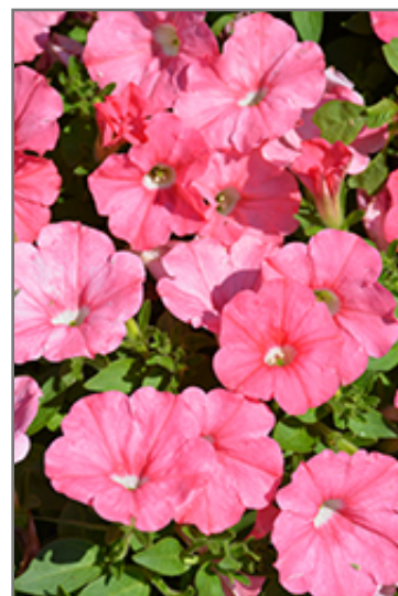
Supertunia Bermuda Beach Petunia flowers