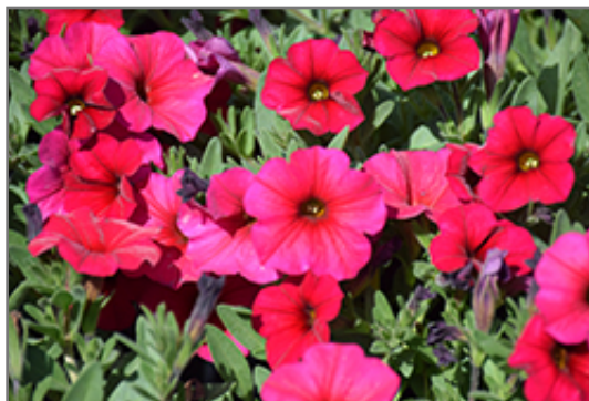
SuperCal Cherry Petchoa flowers

SuperCal Cherry Petchoa is recommended for the following landscape applications;