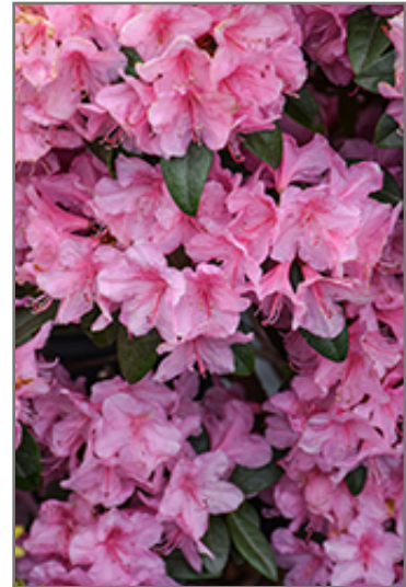
Aglo Rhododendron flowers