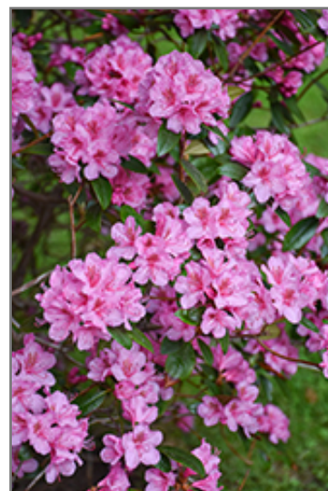
Aglo Rhododendron flowers

This shrub does best in full sun to partial shade. You may want to keep it away from hot, dry locations that receive direct afternoon sun or which get reflected sunlight, such as against the south side of a white wall. It requires an evenly moist well-drained soil for optimal growth, but will die in standing water. It is very fussy about its soil conditions and must have rich, acidic soils to ensure success, and is subject to chlorosis (yellowing) of the foliage in alkaline soils. It is somewhat tolerant of urban pollution, and will benefit from being planted in a relatively sheltered location. Consider applying a thick mulch around the root zone in winter to protect it in exposed locations or colder microclimates. This particular variety is an interspecific hybrid.