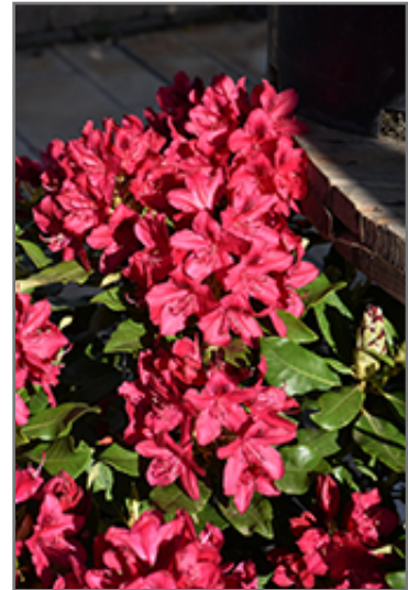
Nova Zembla Rhododendron flowers

This plant is not reliably hardy in our region, and certain restrictions may apply; contact the store for more information.