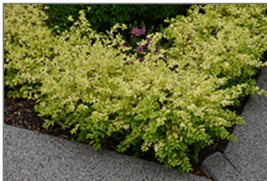
Twiggy Box Honeysuckle

Twiggy Box Honeysuckle is recommended for the following landscape applications;