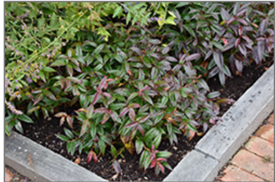
Scarletta Fetterbush

This plant is not reliably hardy in our region, and certain restrictions may apply; contact the store for more information.