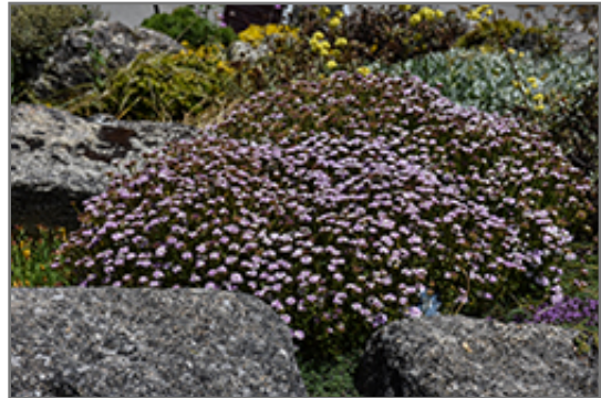
Pink Ice Candytuft in bloom

This plant is not reliably hardy in our region, and certain restrictions may apply; contact the store for more information.