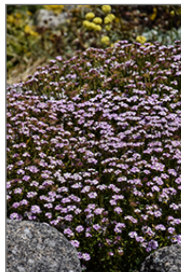
Pink Ice Candytuft flowers