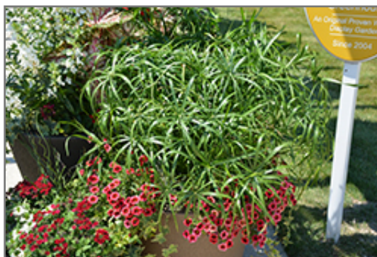
Baby Tut Umbrella Grass