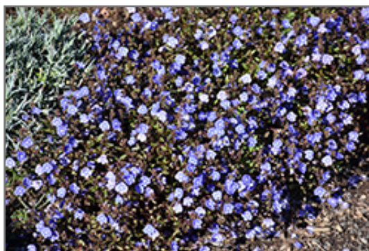
Georgia Blue Speedwell in bloom