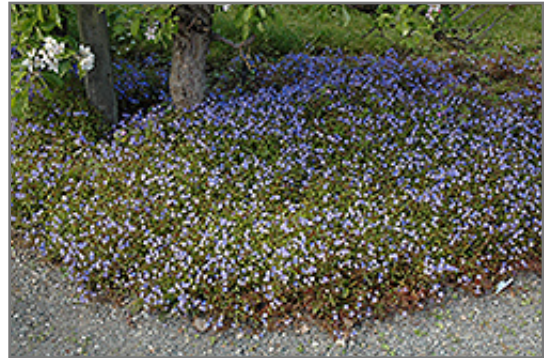
Georgia Blue Speedwell in bloom

Georgia Blue Speedwell will grow to be only 4 inches tall at maturity extending to 6 inches tall with the flowers, with a spread of 24 inches. When grown in masses or used as a bedding plant, individual plants should be spaced approximately 18 inches apart. Its foliage tends to remain low and dense right to the ground. It grows at a fast rate, and under ideal conditions can be expected to live for approximately 10 years. As an herbaceous perennial, this plant will usually die back to the crown each winter, and will regrow from the base each spring. Be careful not to disturb the crown in late winter when it may not be readily seen!