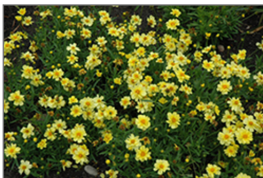
Galaxy Tickseed in bloom