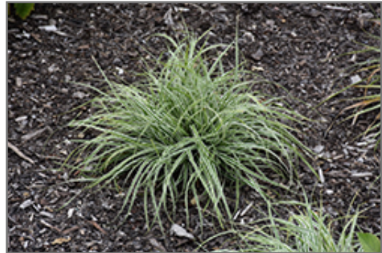
EverColor Everest Japanese Sedge

EverColor Everest Japanese Sedge will grow to be about 16 inches tall at maturity, with a spread of 16 inches. Its foliage tends to remain dense right to the ground, not requiring facer plants in front. It grows at a medium rate, and under ideal conditions can be expected to live for approximately 10 years. As an evergreen perennial, this plant will typically keep its form and foliage year-round.