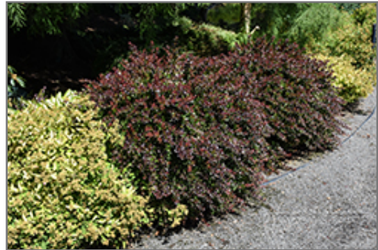
Midnight Ruby Barberry