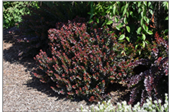
Midnight Ruby Barberry

This plant is not reliably hardy in our region, and certain restrictions may apply; contact the store for more information.