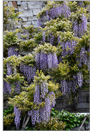
Macrobotrys Wisteria flowers

This plant is not reliably hardy in our region, and certain restrictions may apply; contact the store for more information.