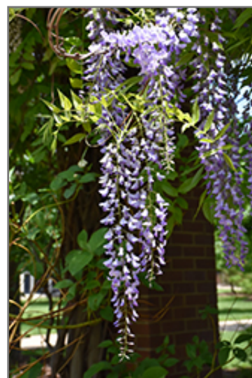
Macrobotrys Wisteria flowers