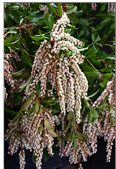
Mountain Fire Japanese Pieris flowers