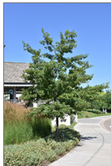
Majestic Skies Northern Pin Oak