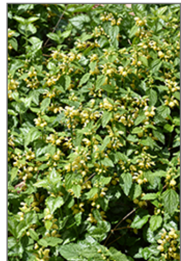
Yellow Archangel flowers