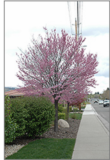
Eastern Redbud (tree form) in bloom

This plant is not reliably hardy in our region, and certain restrictions may apply; contact the store for more information.