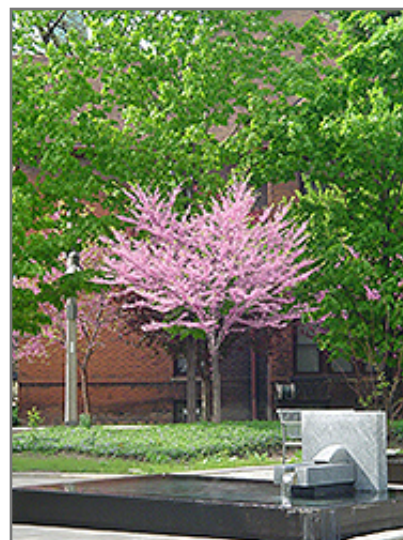
Eastern Redbud (tree form) in bloom