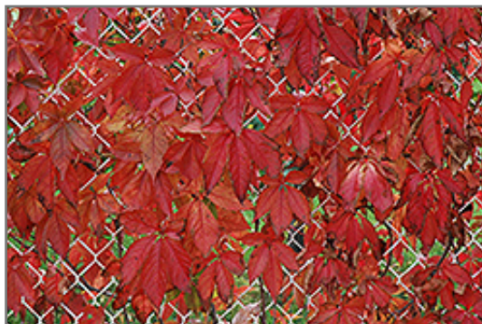
Englemann Ivy in fall