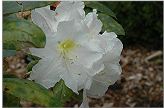
Mysterious Maddenii Rhododendron flowers

A stunning variety with large white blooms accented with pink and a yellow throat; an unusual showy and fragrant plant; absolutely must have well-drained, highly acidic and organic soil, use plenty of peat moss when planting