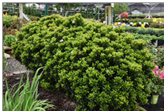
Dwarf Yeddo Hawthorn