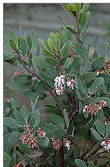
Eve Case Coffeeberry flowers