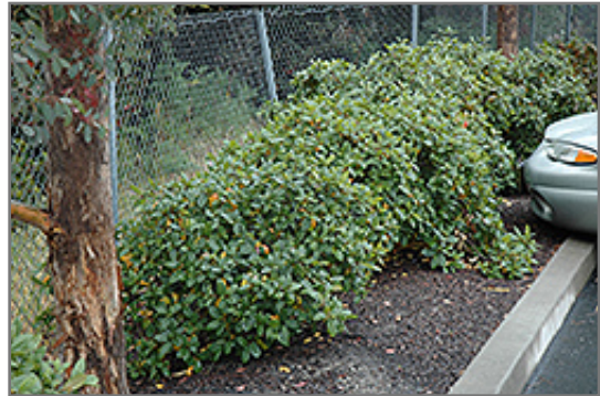
Eve Case Coffeeberry

This plant is not reliably hardy in our region, and certain restrictions may apply; contact the store for more information.