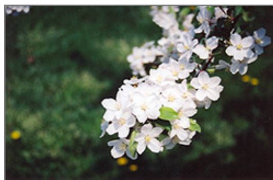
Professor Sprenger Flowering Crab flowers