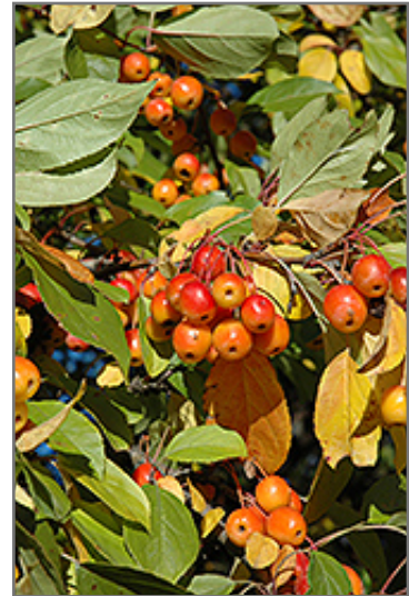
Professor Sprenger Flowering Crab fruit

This plant is not reliably hardy in our region, and certain restrictions may apply; contact the store for more information.