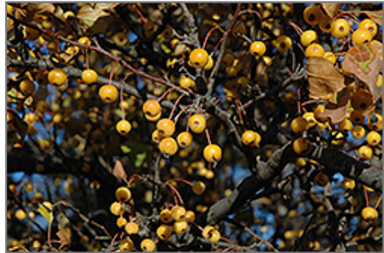
Bob White Flowering Crab fruit

This plant is not reliably hardy in our region, and certain restrictions may apply; contact the store for more information.