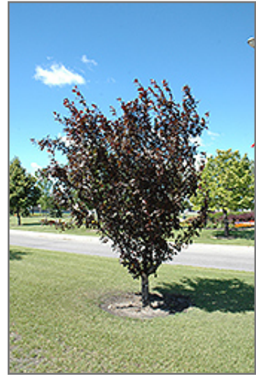
Thunderchild Flowering Crab

This tree should only be grown in full sunlight. It prefers to grow in average to moist conditions, and shouldn't be allowed to dry out. It is not particular as to soil type or pH. It is highly tolerant of urban pollution and will even thrive in inner city environments. This particular variety is an interspecific hybrid.