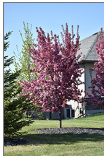
Thunderchild Flowering Crab in bloom

Thunderchild Flowering Crab is recommended for the following landscape applications;