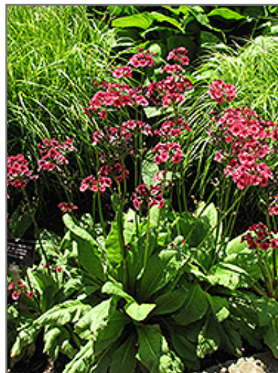
Miller's Crimson Primrose in bloom