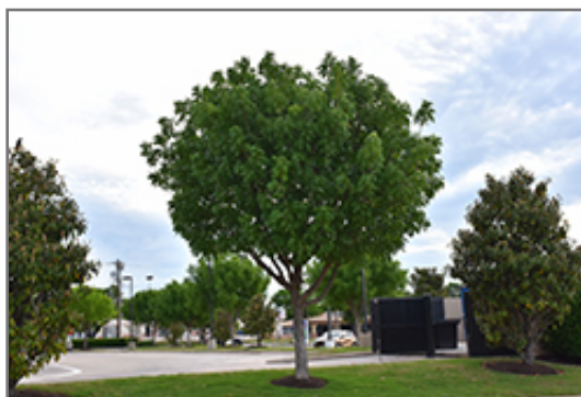
Chinese Pistache