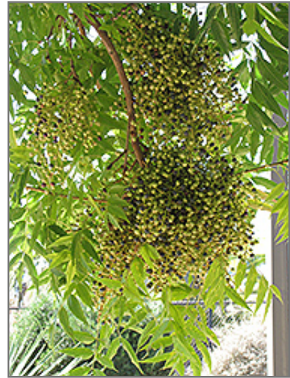
Chinese Pistache fruit

This plant is not reliably hardy in our region, and certain restrictions may apply; contact the store for more information.