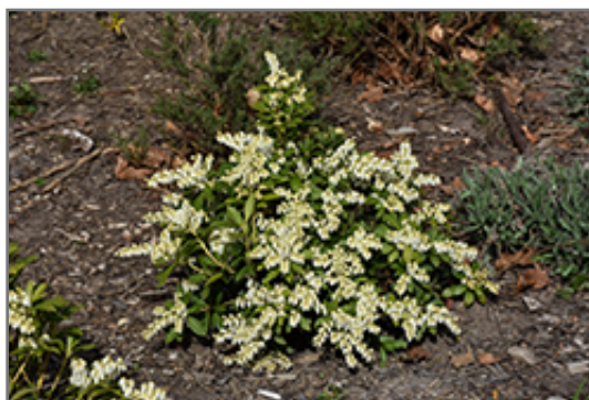
Cavatine Dwarf Japanese Pieris in bloom