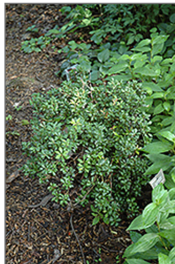
Bisbee Dwarf Japanese Pieris