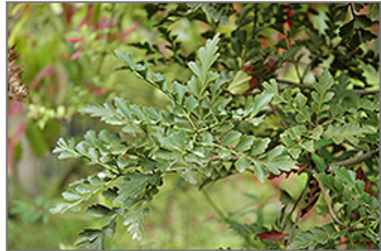
Celery Pine foliage