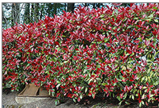
Red Robin Photinia