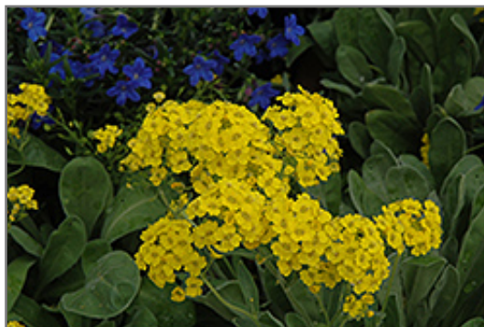
Basket Of Gold Alyssum flowers