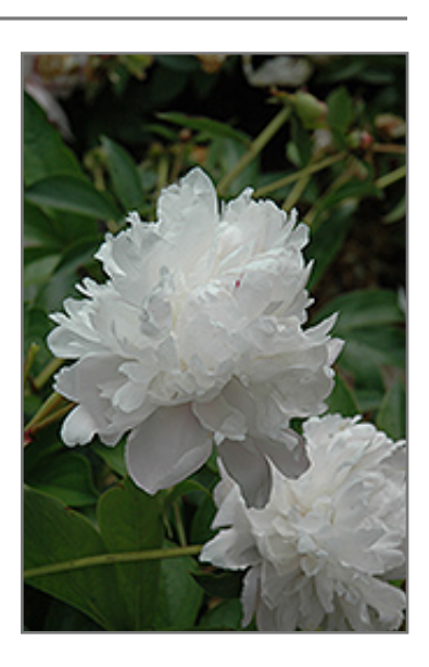
Sarah Carstensen Peony flowers

Sarah Carstensen Peony will grow to be about 30 inches tall at maturity, with a spread of 3 feet. When grown in masses or used as a bedding plant, individual plants should be spaced approximately 30 inches apart. The flower stalks can be weak and so it may require staking in exposed sites or excessively rich soils. It grows at a slow rate, and under ideal conditions can be expected to live for approximately 20 years. As an herbaceous perennial, this plant will usually die back to the crown each winter, and will regrow from the base each spring. Be careful not to disturb the crown in late winter when it may not be readily seen!