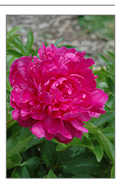
Rubra Superba Peony flowers

Rubra Superba Peony will grow to be about 30 inches tall at maturity, with a spread of 3 feet. When grown in masses or used as a bedding plant, individual plants should be spaced approximately 30 inches apart. The flower stalks can be weak and so it may require staking in exposed sites or excessively rich soils. It grows at a slow rate, and under ideal conditions can be expected to live for approximately 20 years. As an herbaceous perennial, this plant will usually die back to the crown each winter, and will regrow from the base each spring. Be careful not to disturb the crown in late winter when it may not be readily seen!