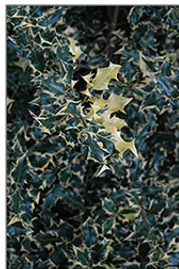
Dapper English Holly foliage