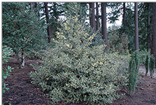
Dapper English Holly