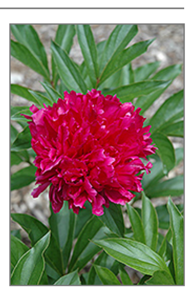
Gloire de Touraine Peony flowers

Gloire de Touraine Peony will grow to be about 30 inches tall at maturity, with a spread of 3 feet. When grown in masses or used as a bedding plant, individual plants should be spaced approximately 30 inches apart. The flower stalks can be weak and so it may require staking in exposed sites or excessively rich soils. It grows at a slow rate, and under ideal conditions can be expected to live for approximately 20 years. As an herbaceous perennial, this plant will usually die back to the crown each winter, and will regrow from the base each spring. Be careful not to disturb the crown in late winter when it may not be readily seen!