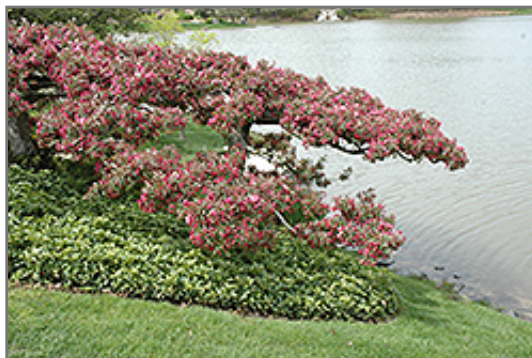
Candied Apple Flowering Crab in bloom