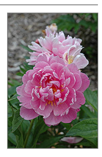
Faustine Peony flowers

Faustine Peony will grow to be about 30 inches tall at maturity, with a spread of 3 feet. When grown in masses or used as a bedding plant, individual plants should be spaced approximately 30 inches apart. The flower stalks can be weak and so it may require staking in exposed sites or excessively rich soils. It grows at a slow rate, and under ideal conditions can be expected to live for approximately 20 years. As an herbaceous perennial, this plant will usually die back to the crown each winter, and will regrow from the base each spring. Be careful not to disturb the crown in late winter when it may not be readily seen!