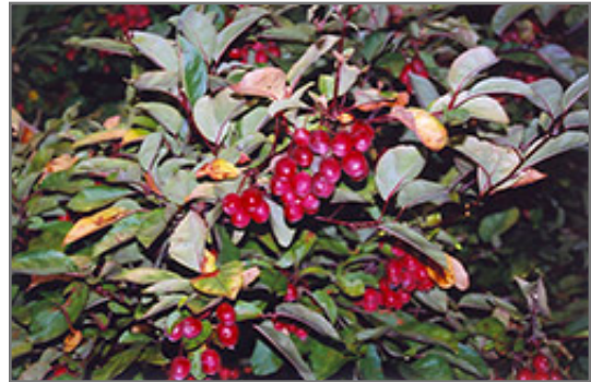
Adams Flowering Crab fruit

This plant is not reliably hardy in our region, and certain restrictions may apply; contact the store for more information.