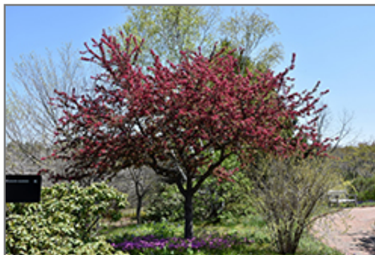
Adams Flowering Crab in bloom