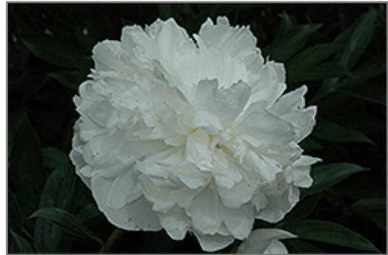
Grace Loomis Peony flowers