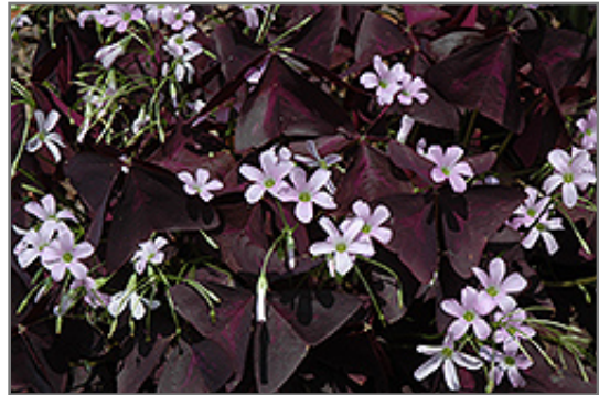
Purple Shamrock flowers