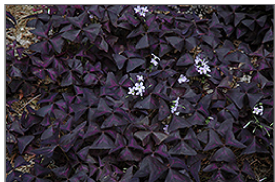
Purple Shamrock foliage