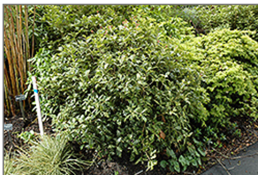
Variegated False Holly