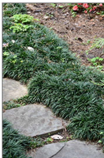
Dwarf Mondo Grass